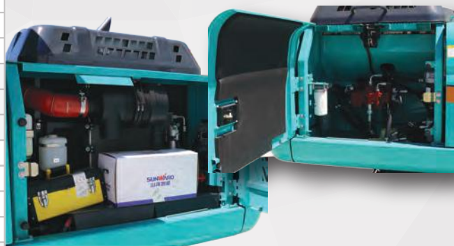
Cummins Engine with Tier 4 Final