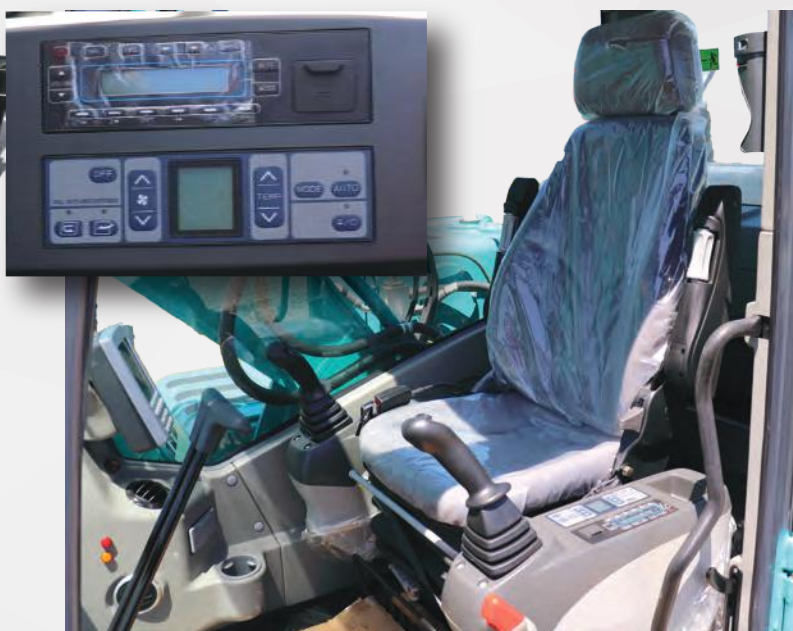
Enclosed cab offers air conditioning and LCD Touchscreen for optimal working