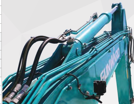
Dual-Braided Hydraulic Lines for safety and durability