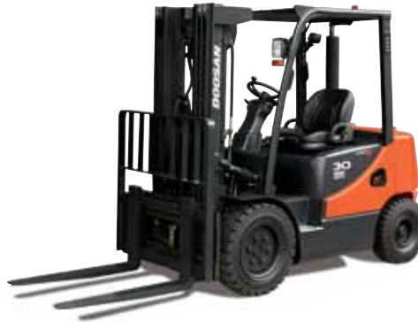
D20S / D25S / D30S / D33S-5 & D35C-5 G20E / G25E / G30E-5 G20P / G25P / G30P / G33P-5 & G35C-5 2,000kg 2,500kg 3,000kg 3,300kg 3,500kg Diesel, LP, Pneumatic Tire