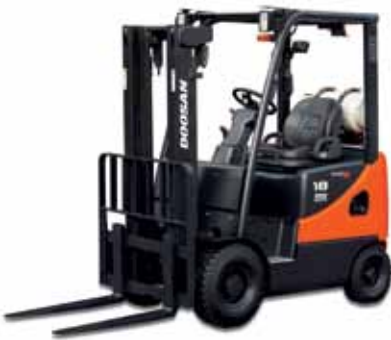
D15S / D18S-5 & D20SC-5 G15S / G18S-5 & G20SC-5 1,500kg 1,750kg 2,000kg Diesel, LP, Pneumatic Tire