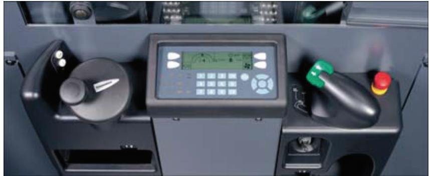
Controls, drive side