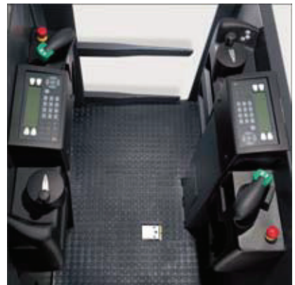
Controls, load side and drive side