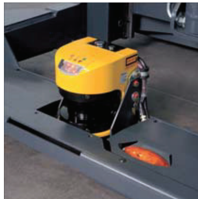
Jungheinrich personnel protection system